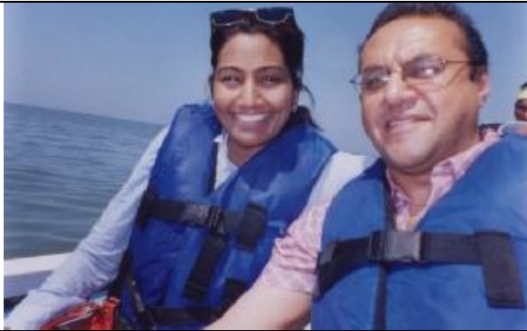
Indian Ocean on a speedboat with Pinx.