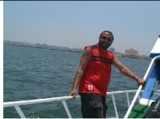
Mediterranean Sea in a speedboat.