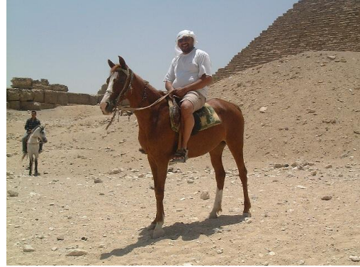
On a horse at the pyramids in Egypt.