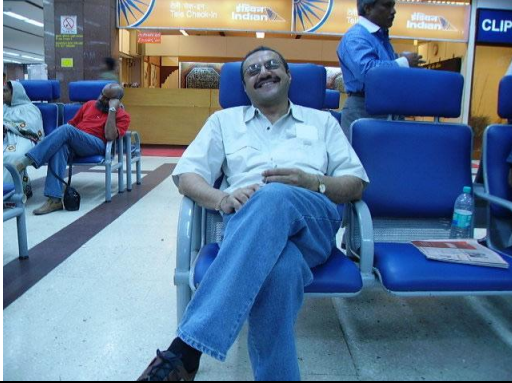
I've spent many days sitting in airports. This is Mumbai Domestic Airport at Chhatrapati Shivaji.