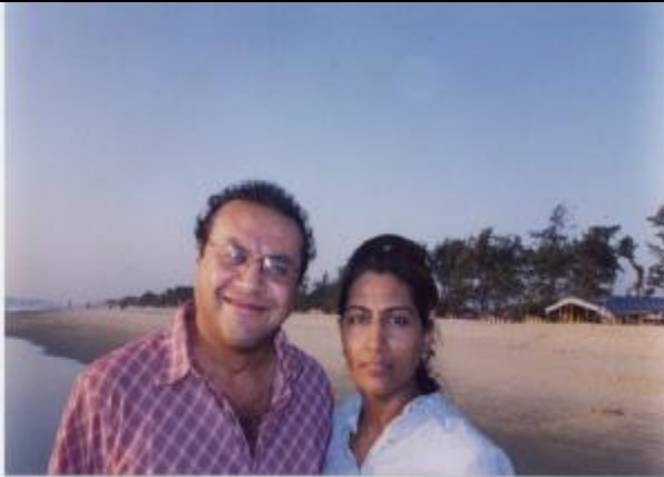
With Pinx in Goa.