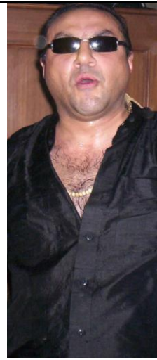
Trance nation all night rave, complete with hairy chest.