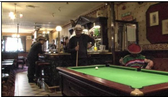
A still from my film, Hurricane