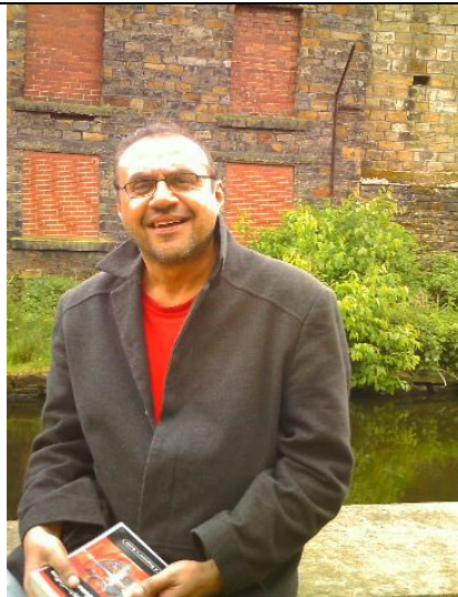
The last time I launched a book.