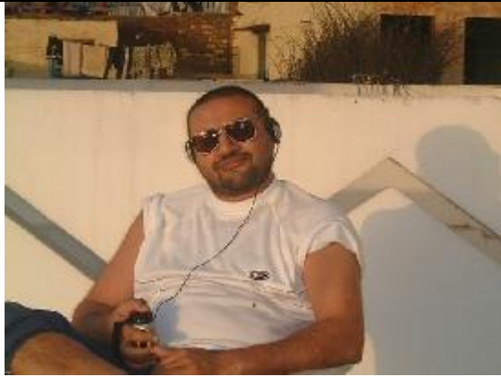
Looking cool and deadly in a village.