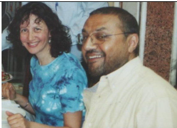
Feeling amorous in Arabia