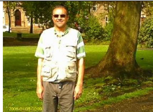
In my intrepid explorer gear.