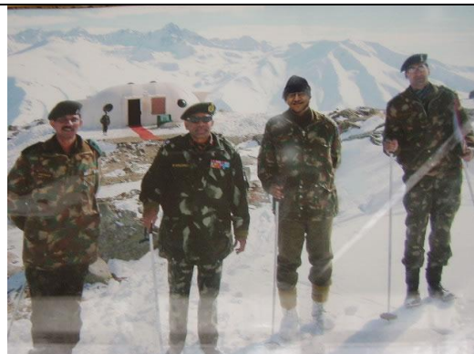
Manoeuvres with the Indian Army.