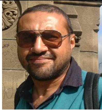
Not looking cool and deadly.