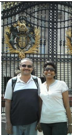
At the Palace, practising for my OBE.