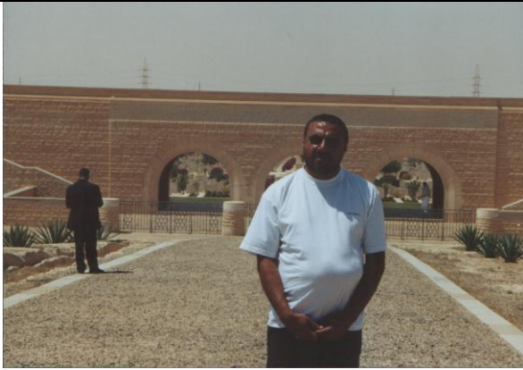
At El-Alamein war graves.